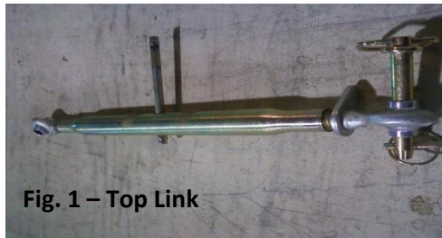
Fig. 1 – Top Link

**Some models of Tractors may vary on top link location. The top link should sit as level as possible when the TR3 is operational.